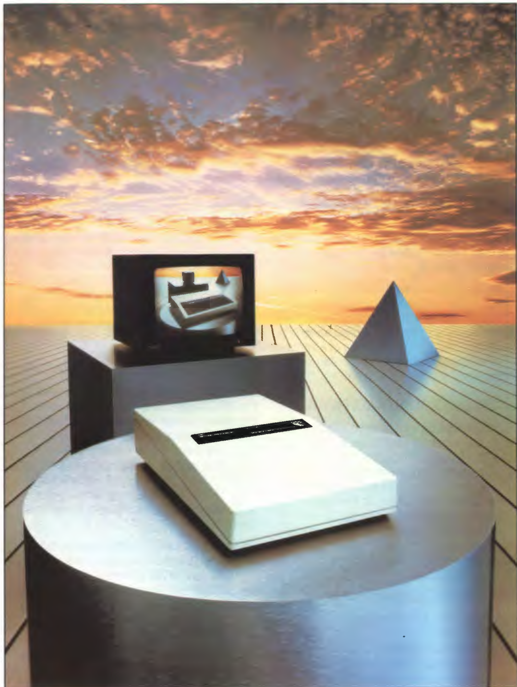
The British Broadcasting Corporation Microcomputer Z80 Second Processor